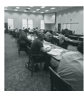
The Board of Foresters administered the Registered Foresters exam to the graduating senior class of foresters at the Auburn School of Forestry and Wildlife Science building. Twentyone students sat for the exam. This is the sixth year the Board has administered the exam to students.

14. Licensees will report their continuing education credits on their license renewal form. Documentation must be retained by each licensee and must include evidence of completion of each course or program, a